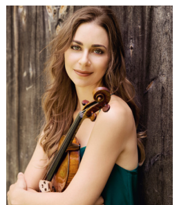
ALEXANDRA PREUCIL - Concertmaster. The world-renowned violinist and musical advisor to Cleveland Ballet has conducted an international search across many countries seeking talented musicians for Cleveland Ballet Orchestra. Comprising 25 experienced performers, Cleveland Ballet Orchestra and Ms. Preucil will present their fresh interpretation not only of Tchaikovsky's classical score but also of Anna Segal's new composition.